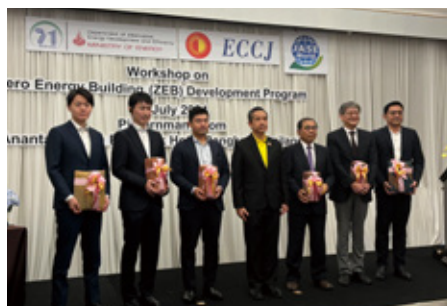
Workshop on Zero Energy Building (ZEB) Development Program in Thailand