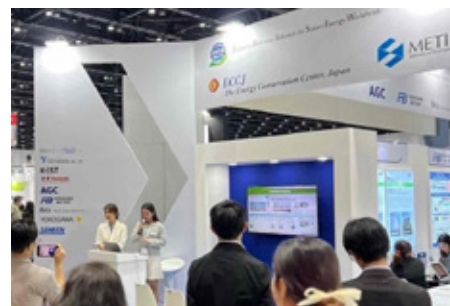
ASEAN Sustainable Energy Week (Exhibition)