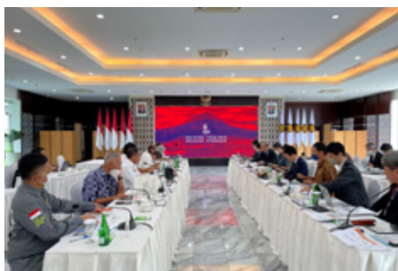
Joint public and private mission to Indonesia

JASE-W comprehensively and practically supports the development of energy-saving businesses of Japanese companies, such as dispatching member companies on missions, holding business forums in target countries and participating in international energy exhibitions.