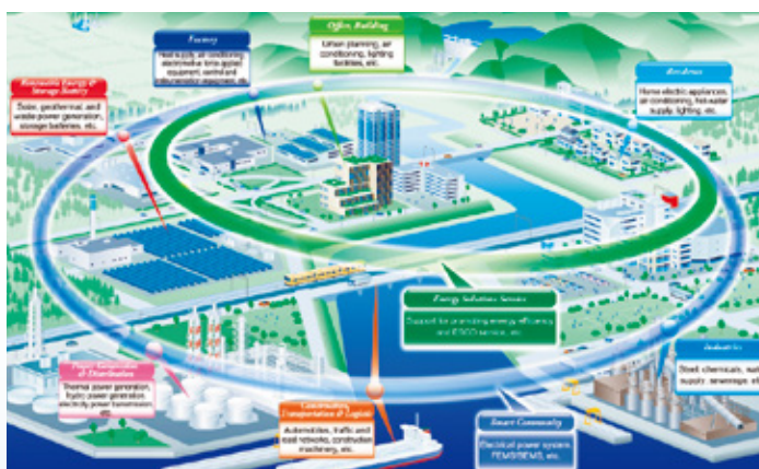
Conceptual map and business areas